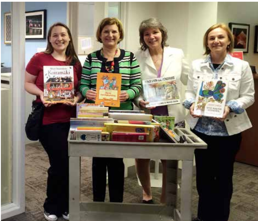
STORIES FROM AFAR: Members of Rice's OISS office and the Pi Beta Phi Library at Texas Children's Hospital proudly display the international books collected to celebrate the university's centennial.

International Program Administrator Office of International Students and Scholars