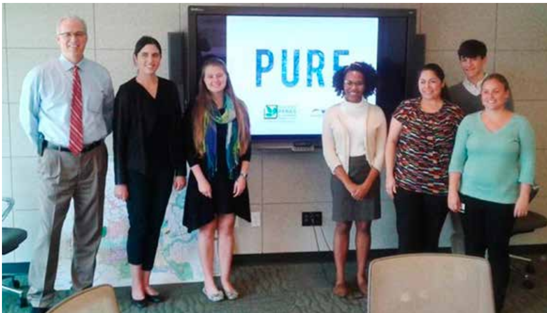
MAKING PARKS BETTER BY COLLABORATION: Members of the 2015 HART team and CCL present PURE to help analyze the quality of Houston's parks.

Since 2014, the Houston Parks and Recreation Department (HPARD) has collaborated with the Center for Civic Leadership (CCL)