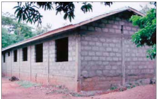
BUILDING OPPORTUNITY FOR YOUNG MINDS: Before the new school was built, students attended classes in shacks, had to bring their own chairs and huddled together to avoid leaks in the roof when it rained. But their enthusiasm for learning never dampened. Now, they have a four-room concrete schoolhouse, where they can expand their minds.